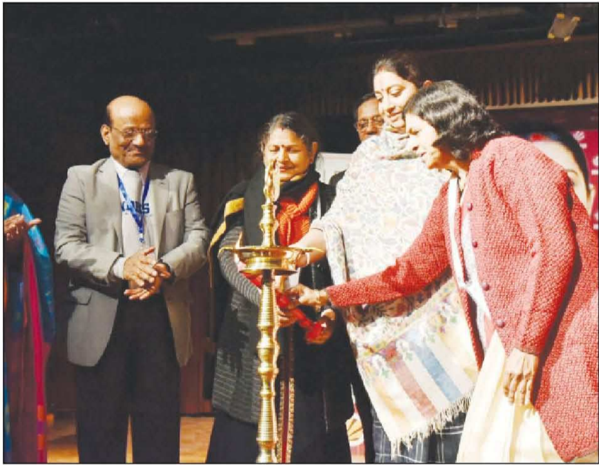
The Union Minister for Textiles, Smt. Smriti Irani lighting the lamp to inaugurate the Women science Congress, during the 106th Indian science Congress, in Jalandhar Punjab.