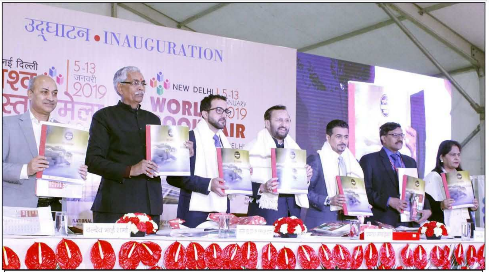
The Union Minister for Human Resource Development, Shri Prakash Javadekar releasing the Catalogue of Braille books, published by NBT, at the inauguration of the New Delhi World Book Fair, at Pragati Maidan, New Delhi.

journey, I have got support from many non-Congress political parties. I will also not contest the 2019 Lok Sabha elections... Converting the anti-corruption movement into a political party in 2012 was wrong," he said. AAP, formed by Arvind Kejriwal and others, was an offshoot of the anti-corruption movement that took India by storm. While AAP refused to offer an official comment on the issue, party functionaries said its openness towards an alliance with the Congress for this year's Lok Sabha elections in its recent national